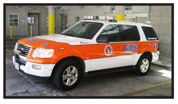
Rapid Response 1, stationed at the Kuakini Medical Center, is one of two nonambulance, non-transport vehicles that the state requires the city to operate. These vehicles are staffed with a paramedic.