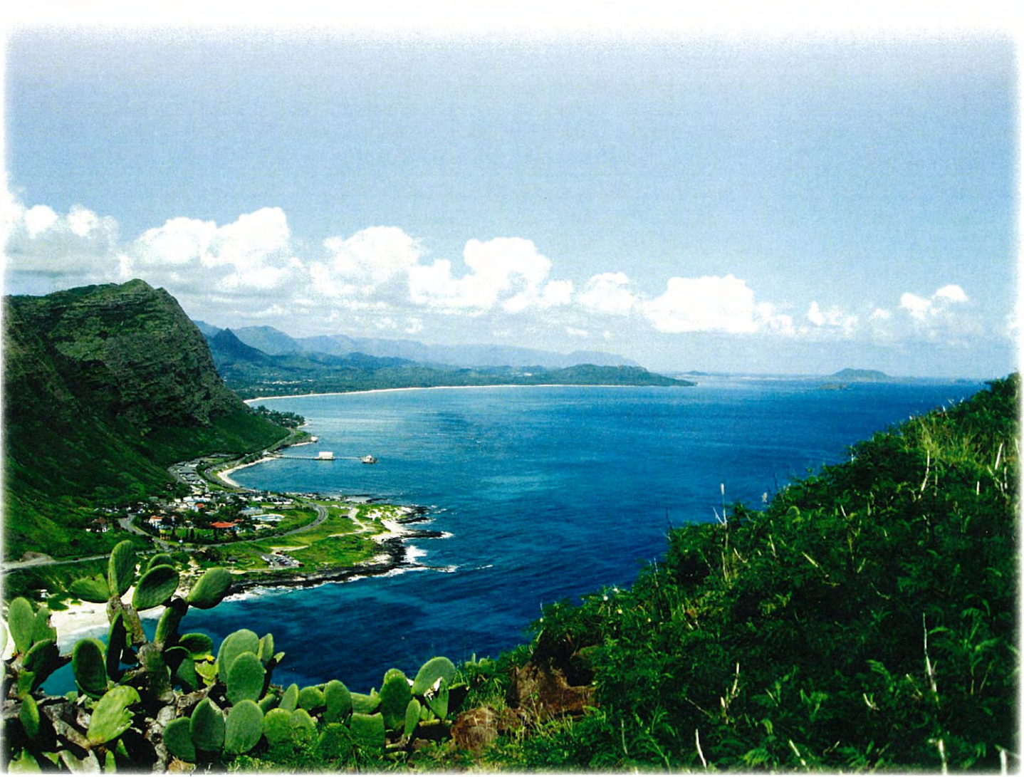
Report No. 12-01/December 2011