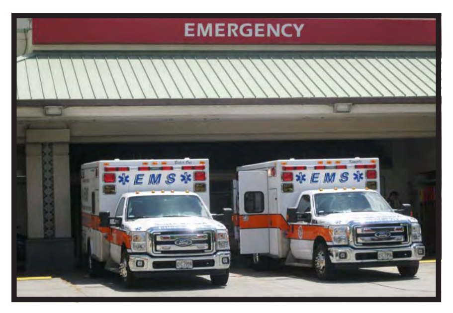
EMS ambulance units Baker 1 and Kane'ohe pull into The Queen's Medical Center emergency loading bay to drop off transports. Honolulu unit Baker 1 achieved the 10-minute response time at the 90<sup>th</sup> percentile less than 61 percent of the time between FY 2008 and FY 2010. The Kan'eohe unit met the 15minute response time 92 percent of the time in FY 2010.