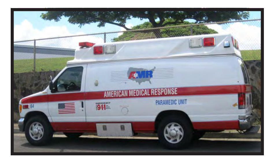
Exhibit 4.2 American Medical Response Ambulance

Over the last three years, the city has used AMR services more frequently. From FY 2008 to FY 2010, the total number of calls for AMR ambulance responses increased 354 percent for basic life support calls, and 12,800 percent for advanced life support calls.